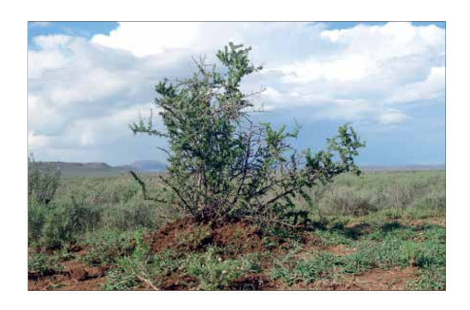
TURNING A BUSH 180° I dig out a bush and turn it 180 degrees in the ground. Karoo Desert / South Africa / 2015