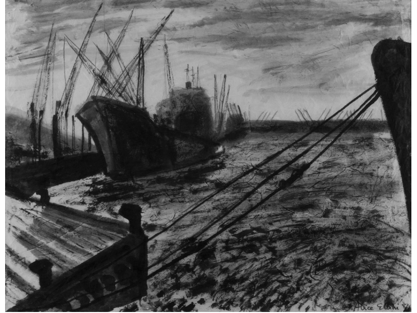
"South Easter" - Cape Town Docks • 1980 • 440 mm x 560 mm Indian Ink on Rice Paper