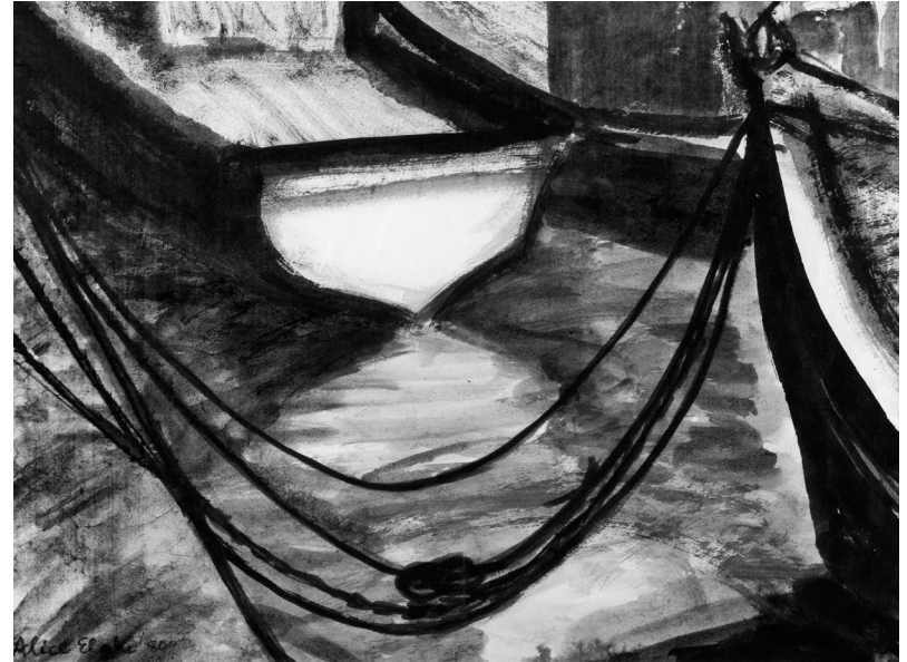
"At Anchor" - Cape Town Docks • 1980 • 450mm x 580mm Indian Ink on Rice Paper