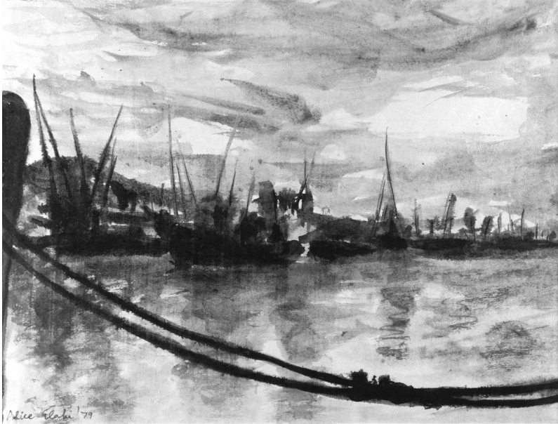
"Ship roped to the Bollard" - Signal Hill in distance • 1979 • 440mm x 570mm • Indian Ink on Rice Paper