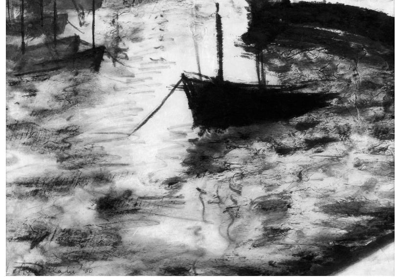
"In Harbour" • 1980 • 440 mm x 560 mm • Indian Ink on Rice Paper