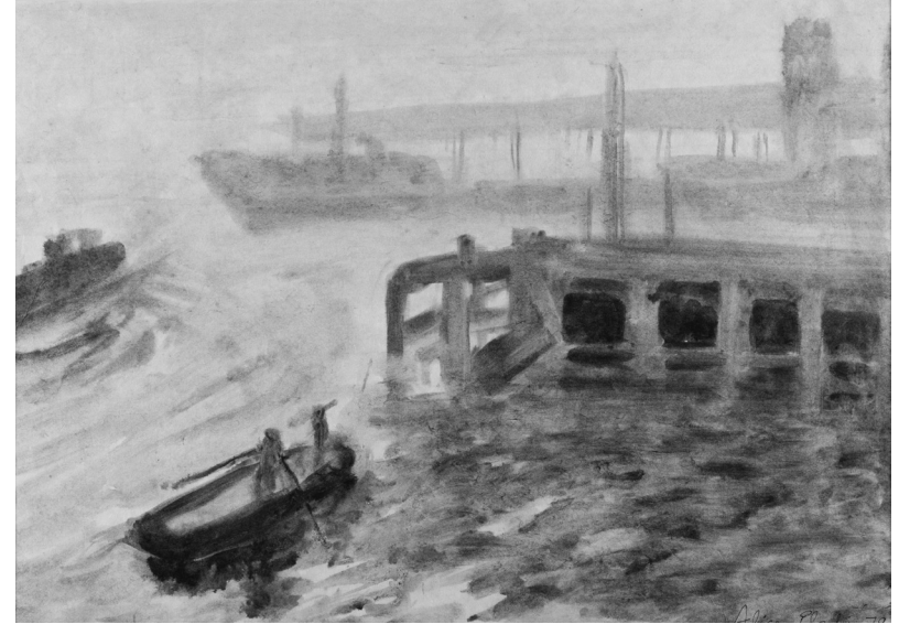
"Old Penny Ferry in the mist" - Cape Town Docks • 1979 420mm x 580mm • Indian Ink on Rice Paper