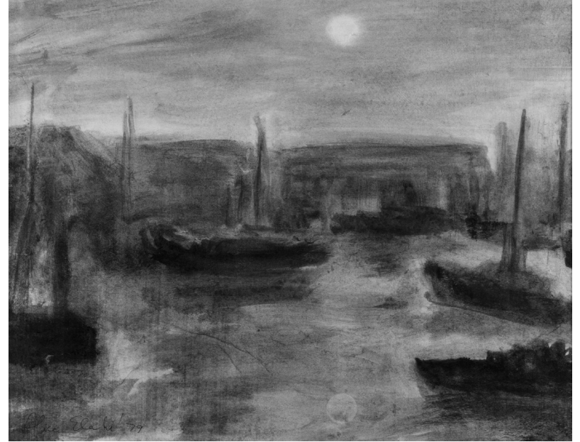
"Moonlight in the fog" - Painted where the Waterfront now stands, looking towards Green Point • 1979 • 420mm x 530mm Indian Ink on Rice Paper