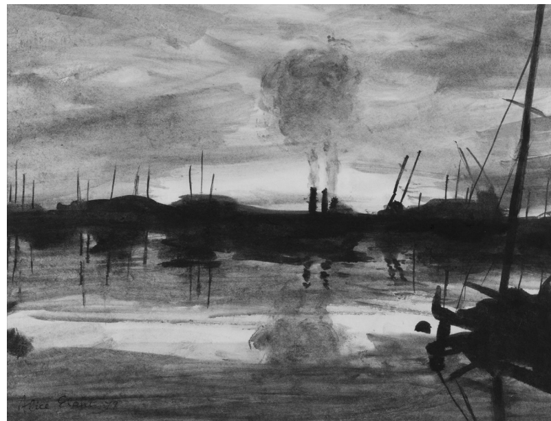
"Early morning yacht basin" • 1979 • 410mm x 540mm Indian Ink on Rice Paper