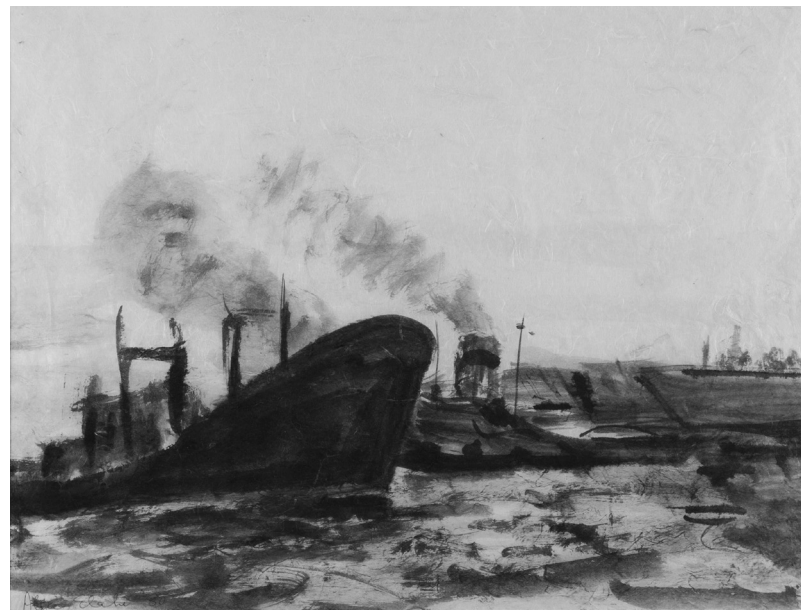
"Large ship coming into harbour" • 1980 • 390mm x 500mm Indian Ink on Rice Paper