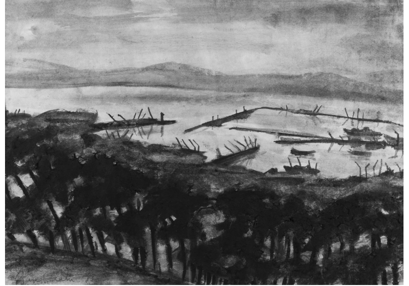
"Harbour from Signal Hill" • 1979 • 410mm x 570mm • Indian Ink on Rice Paper