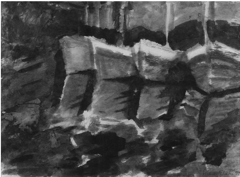
"Boats at night" – Cape Town Docks • 1979 • 390mm x 530mm Indian Ink on Rice Paper