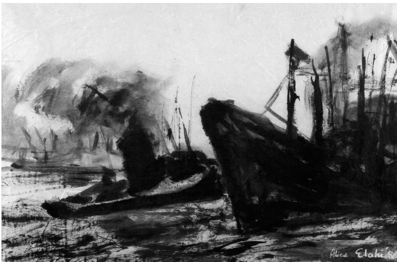
"Steaming" • 1980 • 340mm x 530mm • Indian Ink on Rice Paper