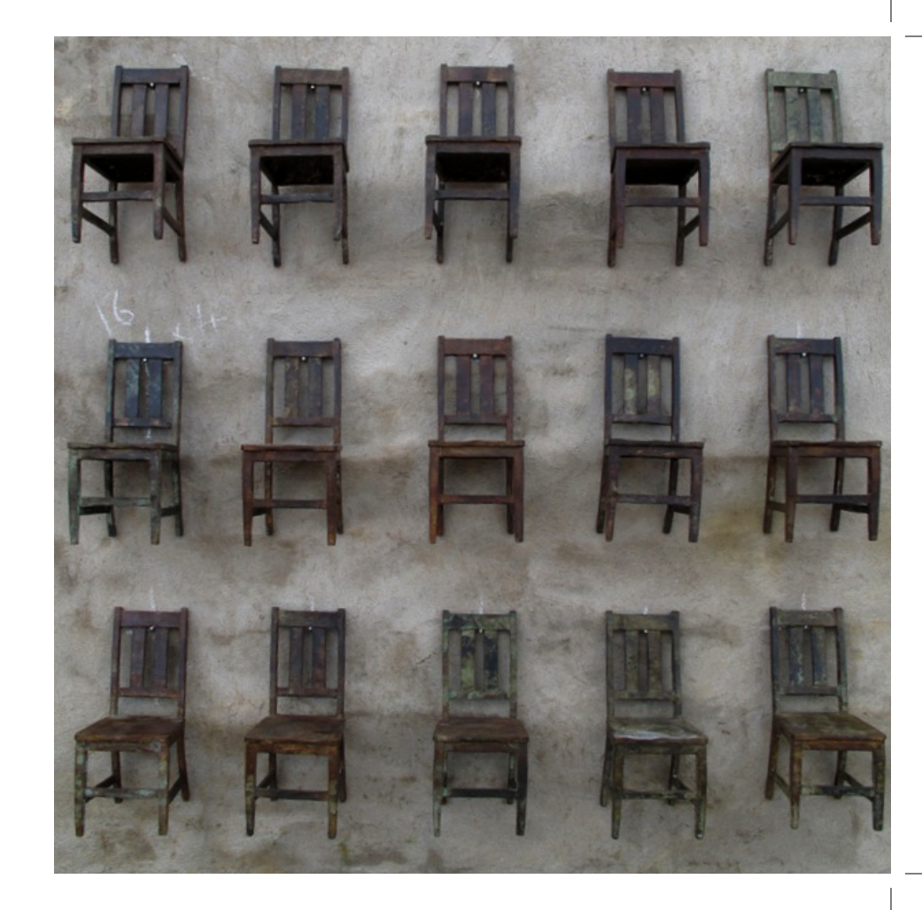
Image: FIFTEEN BRONZE CHAIRS, 2009 Medium: Bronze Dimensions: 185mm x 95mm x 85mm (each) Edition: 150