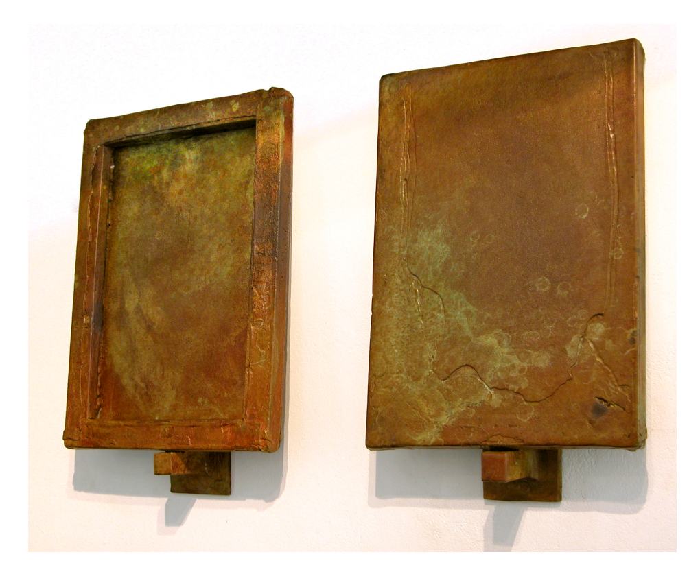
Image: FRONT AND BACK - BRONZE CANVASES, 2004 Medium: Bronze Dimensions: Life size Edition: Unique