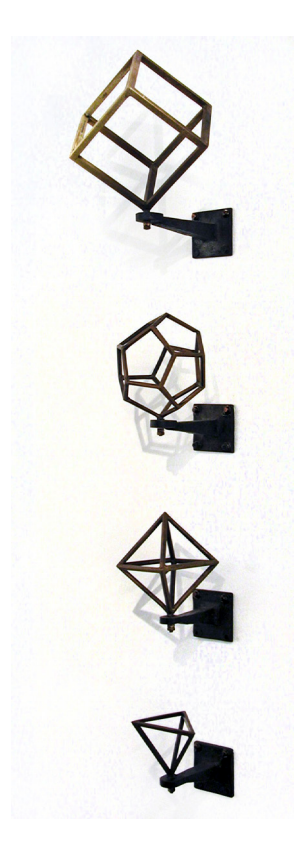
Image: FIVE PERFECT SOLIDS (PLATONIC), 2004 Medium: Bronze and brass Dimensions: Variable Edition: Unique