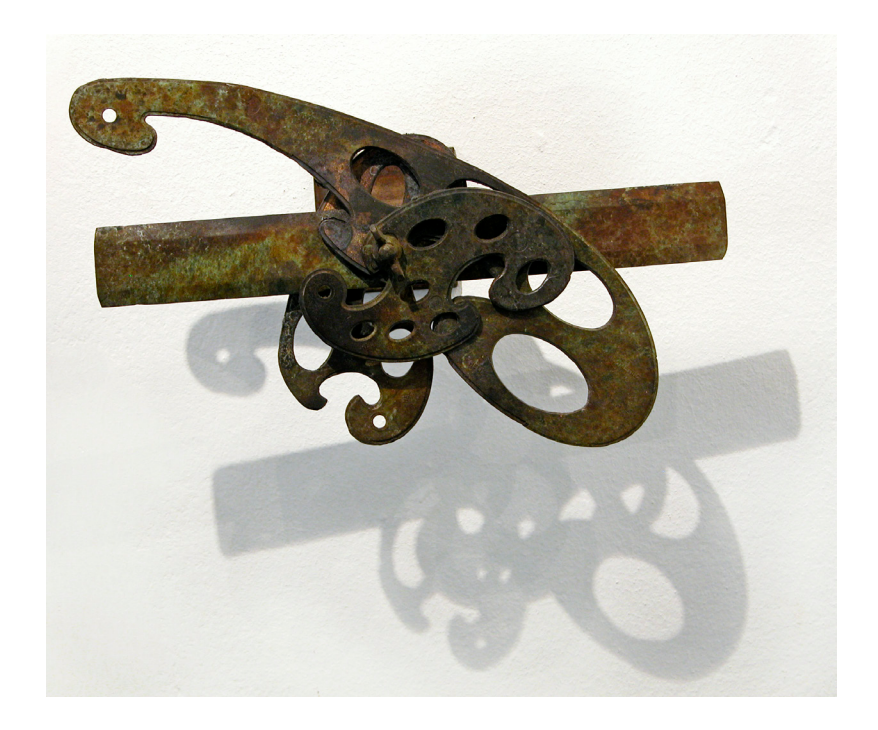
Image: FRENCH CURVES, 2005 Medium: Bronze Dimensions: 300mm x 300mm Edition: Unique